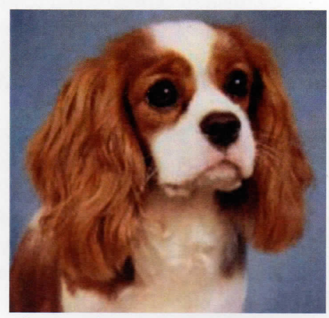
The Cavalier King Charles Spaniel

Many people are unable to recognise the difference between King Charles Spaniels and Cavalier King Charles Spaniels. They are two entirely different breeds and apart from sharing the same coat colours, have totally separate breed standards, characteristics and identities.