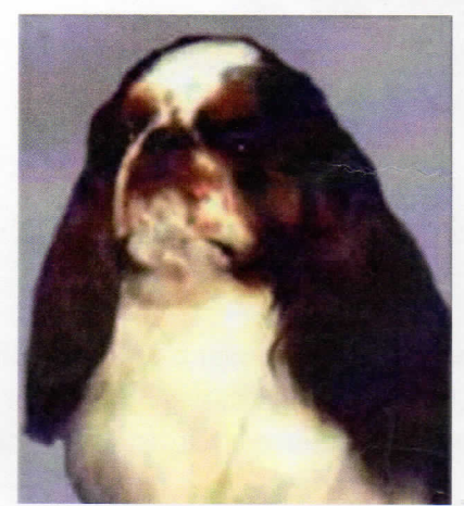
The King Charles Spaniel